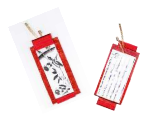
Figure 3. A Student's Bookmark of Lam Tin Methodist Primary School

From student's perspective, they can understand the customs and traditions of different countries through the Campus TV. The Teacher-Librarian and the Student Reading Ambassadors of the Library researched the background of the partner schools and countries before introducing the Project on the Campus TV. All students are able to recognize the national emblem, flag, geographical location, customs, and basic demographics of different countries through the Project. They are especially interested in viewing YouTube videos of other countries such as folk dances and rituals of festival celebration. Furthermore, the origin of the International Bookmark Exchange Project, the ISLM and its annual theme will also be introduced on the Campus TV as well.