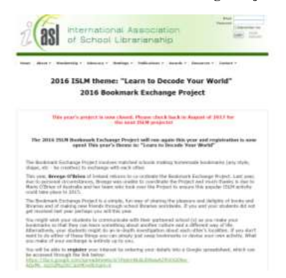
Figure 2. The Home Page of International Bookmark Exchange Project