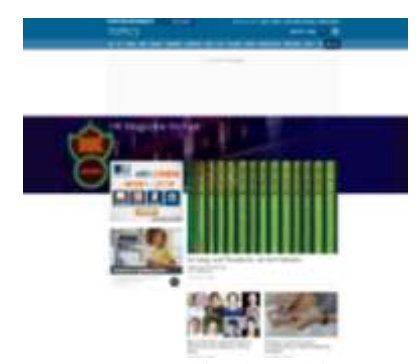
Fig.3 HK Magazine Archive hosted by SCMP Group

from its website even though the publication has ceased publication. This decision has caused a strong reaction from the Hong Kong Journalists Association to lodge an inquiry with SCMP management. In view of the enormous pressure and negative comments from the community, the SCMP Group finally decided that the online content of HK Magazine would be migrated to the SCMP website before the HK Magazine website was removed. (Grundy, 2016b). (See Fig. 3)