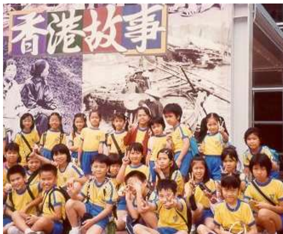
Figure 2. Hong Kong Museum of History Visit

of the Hong Kong Museum of History was invited to deliver a talk at school. They shared with students many interesting stories of the ancient historic events in Hong Kong. All these activities articulated a clear picture in the students' mind that Hong Kong is an indivisible part of China.