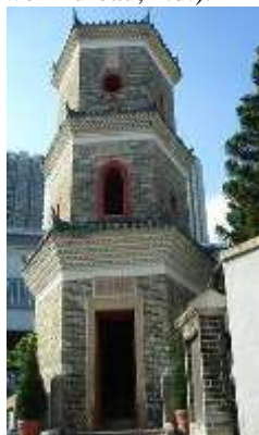
Figure 3. "The Pagoda of Gathering Stars" of the Ping Shan Heritage Trail (Source: Declared Monuments of Hong Kong, 2017).

7.1. Ping Shan Tang Clan Heritage Trail: The Ping Shan Tang Clan Heritage Trail is located in the southwestern New Territories. The trail passes through different small villages such as Hang Tau Tsuen, Hang Mei Tsuen and Sheung Cheung Wai. It consists of several declared monuments and graded buildings. Students could understand the old days of the Tang clan in Ping Shan from the exhibitions of the Ping Shan Tang Clan Gallery and the Heritage Trail Visitor Centre. Tsui Sing Lau (聚星樓) can be claimed to be the most important declared monument of the trail as it is Hong Kong's only ancient pagoda. The pagoda's name in Chinese means "Pagoda of Gathering Stars". It was built more than 600 years ago according to the genealogy of the Tang clan of Ping Shan. Many people believe that the pagoda was originally seven-storey high. It was due to a strong typhoon which damaged the pagoda that only three storeys remain today. The pagoda was built to improve the fengshui of the area. The villagers believed that flooding disasters were prevented and clan members could pass the Imperial Civil Service Examinations with the blessings from this special building. In fact, according to the record of the Education Bureau, the Tang Clan of Ping Shan did produce numerous scholars and officials (Education and Manpower Bureau, n.d.).