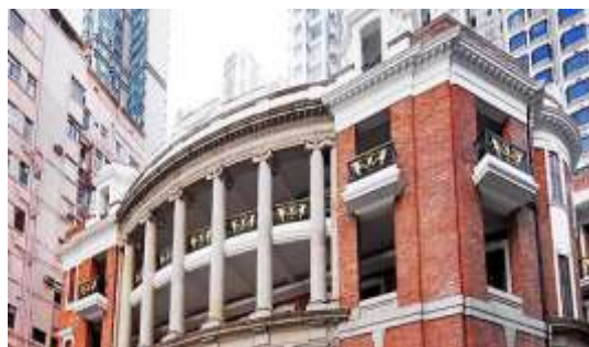
Figure 4. Dr Sun Yat-sen Museum

7.2. Central and Western Heritage Trail: Different from the Ping Shan Tang Clan Heritage Trail, the Central and Western Heritage Trail is located on the northern coast of Hong Kong Island. The entire trail comprises three routes. They are the Central Route, the Sheung Wan Route, and also the Western District and the Peak Route. In this project, the focus was on the Sheung Wan Route as Dr Sun Yat-sen, the "Father of the Nation", was educated, baptized and did the planning of his revolution with comrades in this area. The Dr Sun Yat-sen Museum is located on the Sun Yat-sen Historical Trail. It acts as an important part of the Sheung Wan Route, which was set up by the Central and Western District Council. Buildings of different religions, traditional Chinese buildings, tea houses, and historic sites are found in this place. Fifteen out of thirty-five historic buildings and sites were selected for the study of the Primary Three students along the trail. All those remarkable buildings and sites reflect the growth of the city and witness its development over the years.