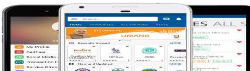
Figure – 3 Your Handset Enter Your Phone Number :